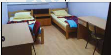
School dorm "Sombor"