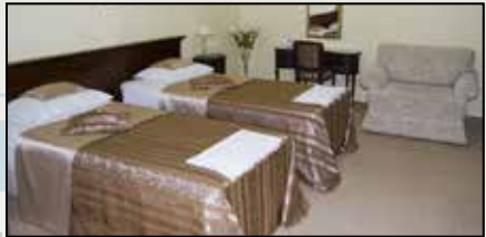
Hotel "Knez Petrol"***, Sombor;