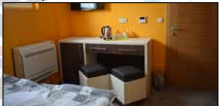
Guesthouse "Karibo"***, Sombor;