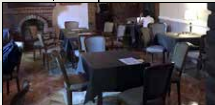
Apartments "Galea"***, Sombor;