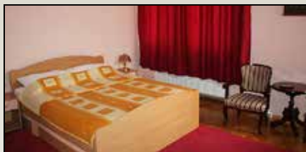
Guesthouse "Piccolina"***, Sombor; www.piccolina.co.rs