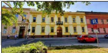
Guesthouse "Stari Slon"***, Sombor; www.starislon.com