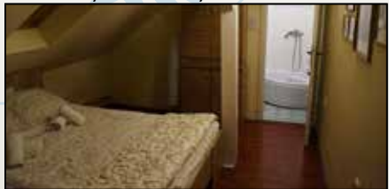
Apartments "Green Town"****, Sombor; www.greentownapartments.om/