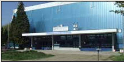
Sports Hall - "Mostonga", Sombor; http://scsoko.rs/