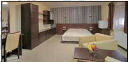
Hotel "Old Brick"***, Sombor; www.oldbrick.rs