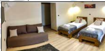
School dorm "Apatin"**, Apatin; www.tehnicka-apatin.edu.rs